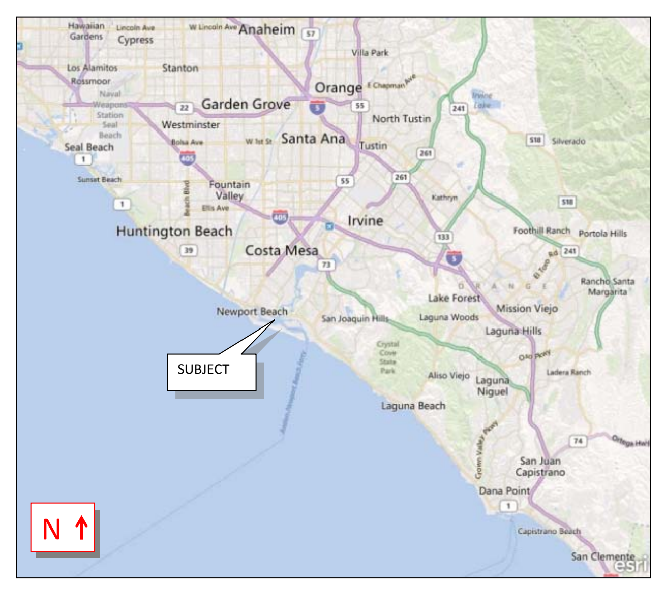
Regional Location Map