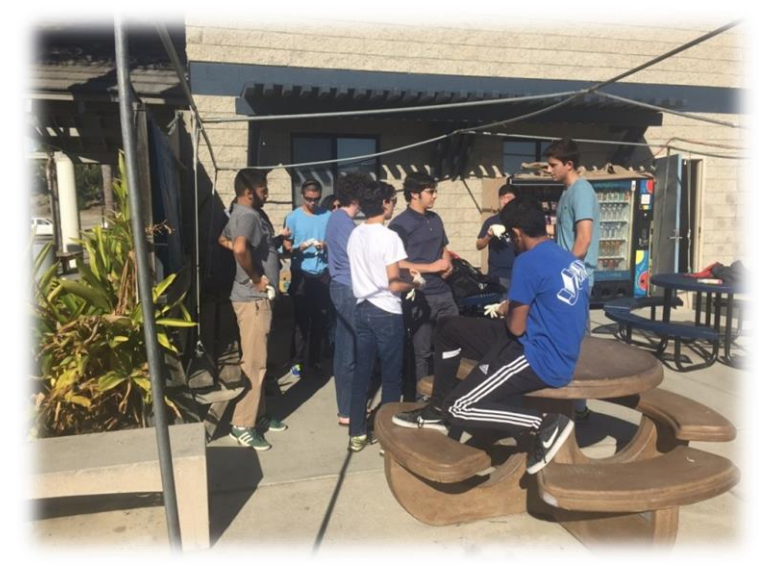
Sage Hill High School students preparing for a beach clean-up event