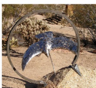
2 Flight Artist: Steven Rieman The engaging stainless steel and bronze sculpture, "Flight", captures an idea not a moment in time. According to the artist, the symbolic bird soaring through a ring of the sun represents a future of wonder with the random letters that cover its form questioning the human experience and how we impact our future.