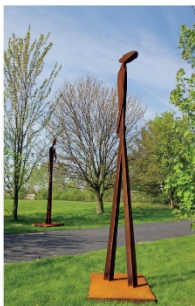
1 Be Still and Know Artist: John Merigian The simplicity of this giant welded steel figure invites viewers to pause and reflect. It exudes a contemplative, soulful emotion that fits well with the peaceful surroundings of the park. Its complexity of form lies in the relationship between space, lines, shadows and silhouettes as the movement of the crossing sun through the day reveals constantly changing shadows and linear components.