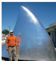
5 Getting Your Bearings Artist: David Boyer Inspired by antique industrial artifacts that can be found in the historic areas of the Western United States, Getting Your Bearings is a kinetic wind sculpture that is monumental in size, whimsical in style, and antique in appearance. Three steel and stainless steel paddle wheels sit atop a massive steel base, trunk and branches, turn effortlessly to create an overhead kaleidoscope of light and shadow.