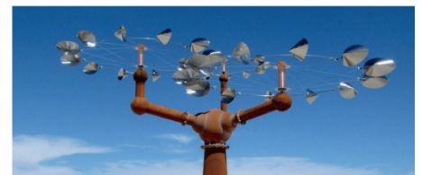
7 Cosmic Glints Artist: Patricia Vader This kinetic wind-driven metal sculpture utilizes mostly upcycled materials in its structure, including bicycle wheels and reflectors. The wheel circle is held together by compression and the largest wheels are bolted to the central motorcycle rim. The smaller wheels spin freely. The colorful, playful sculpture captures the elements of its environment, utilizing the ocean breezes for movement and sparkling sunlight to create glints of light that bounce off the moving aluminum disks.