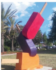
3 Popsicles Artist: Craig Gray This whimsical sculpture stacks three giant colorful popsicles in a pop art creation with a "feel good" attitude that fulfills the artist's goal, "to warm the creative soul and bring happiness to the heart." Chosen as the favorite in a community survey, the steel, wood and stucco sculpture is covered in colorful epoxy that appears to be melting as it hits the warm concrete base.