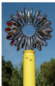
6 No Swimming Artist: Oleg Lobyskin This work was first seen at Burning Man 2008. According to the artist, this conceptual artwork represents deep concern about the impact of human activity and progress on nature. The massive shark's dorsal fin is covered in shiny aluminum leaf and rises 12 feet out of the park landscape.