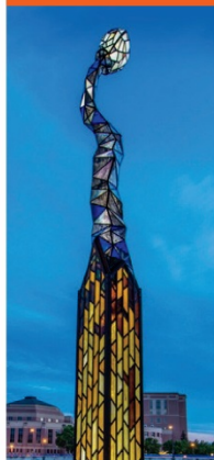
4 Burnt Matchstick Artist: Karl Unnasch Physically inspired by radio tower design, this 40-foot sculpture, with its soft-glowing beacon and slow flicker, captures a fleeting moment in time: the split-second after a burning wooden matchstick has been extinguished by a gust of air. Varying combinations of amber, black, blue and white domestic opalescent glass aggregate in a multi-planar fashion in the construction of this larger-than-life, seemingly innocuous object.