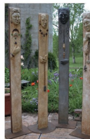
8 Cultural Pedestrians Artist: Sue Quinlan Cultural Pedestrians is a series of freestanding concrete and steel pieces that visually represent different cultures of past and present people from our society and others. The pieces are human-sized, with diverse faces, hands, and artifactual jewelry, illustrating the multifaceted compilation of smaller fragments of thoughts, experiences and aspirations.