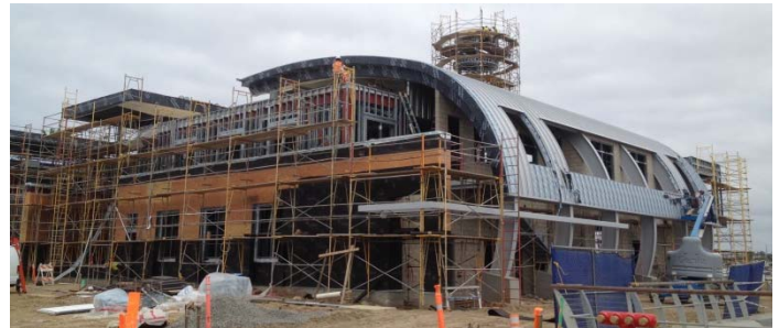
Exterior waterproofing and metal roofing at the Sailing Center