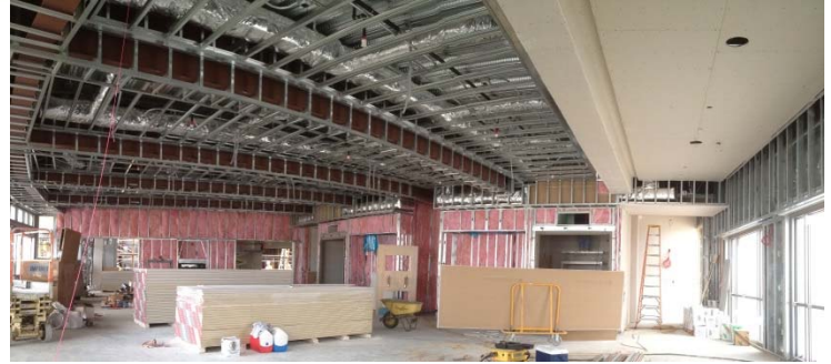
Insulation and drywall underway at the Community Center