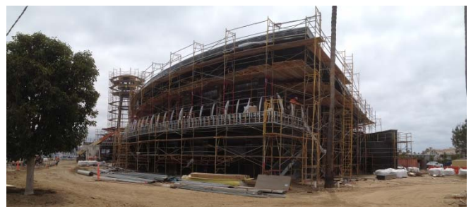
Specimen tree and tension cable handrail system at the Community Center