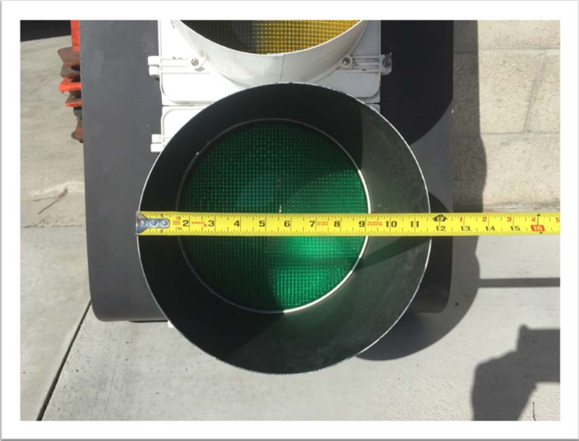
A typical traffic signal head is 12-inches wide and current models contain only 6 LED “bulbs” in each head.