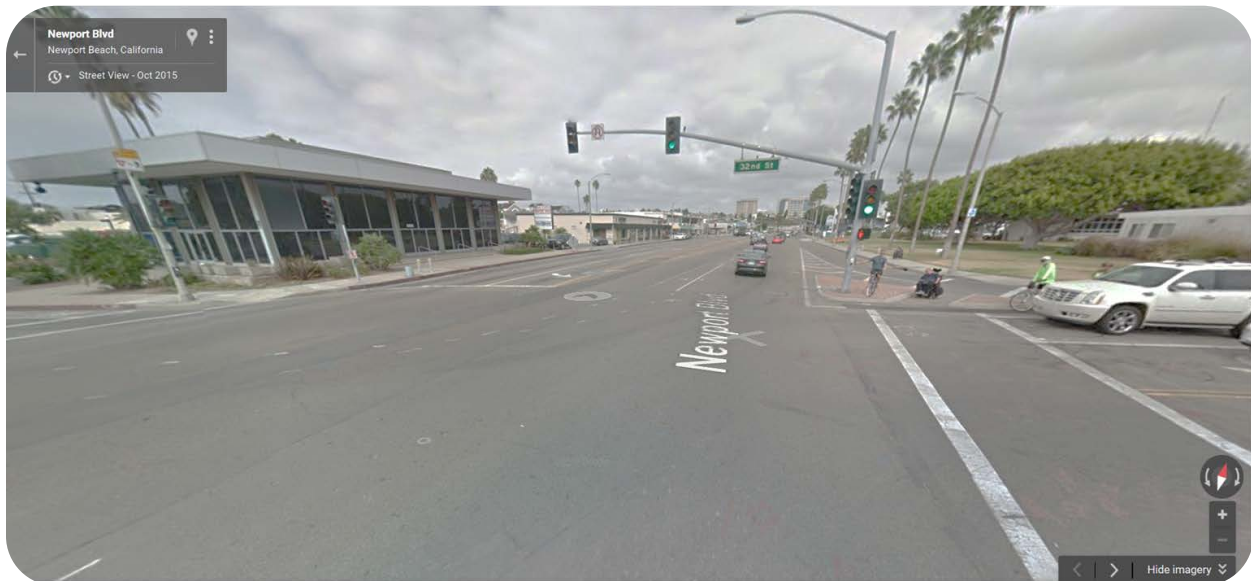
Newport Blvd and 32 nd Street as it looks today, prior to construction. The former Bank/Blockbuster building at the corner will become a new Public Parking Lot

Lane closures will be necessary during the construction and accommodations are planned to reduce lane closures in the morning peak hours.