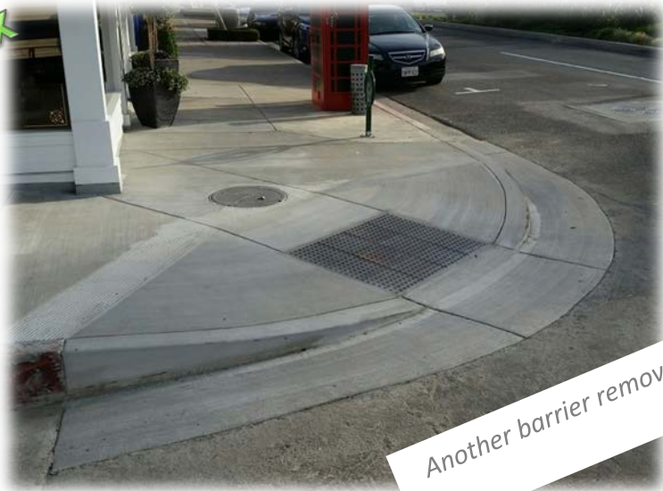
Another barrier removed on Fernleaf and East Coast Hwy!