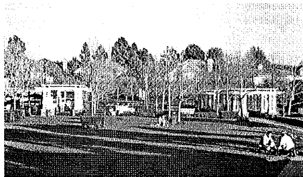
One Ford Road community park

Coordinate with the appropriate home owners association to conduct City recreation programs on private parkland. (Imp 39.2)