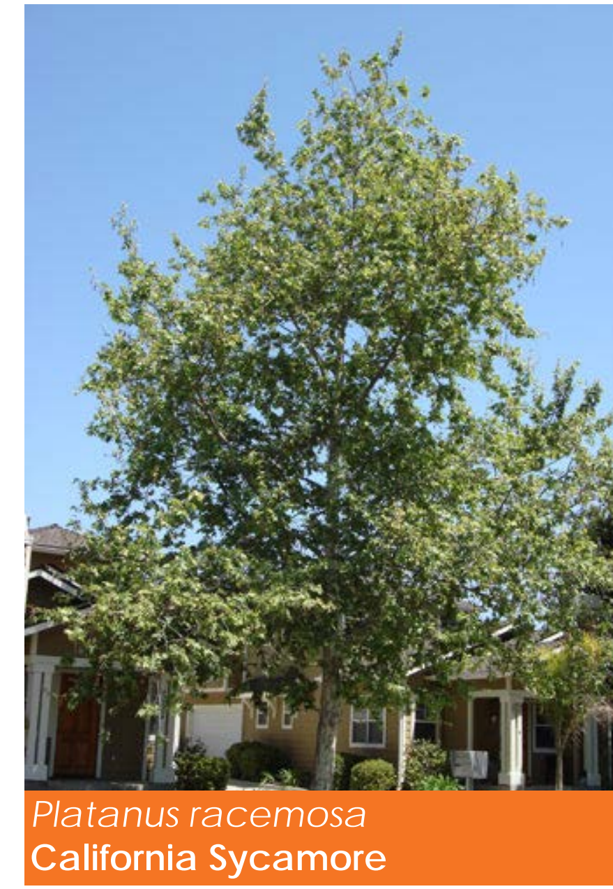
Platanus racemosa California Sycamore