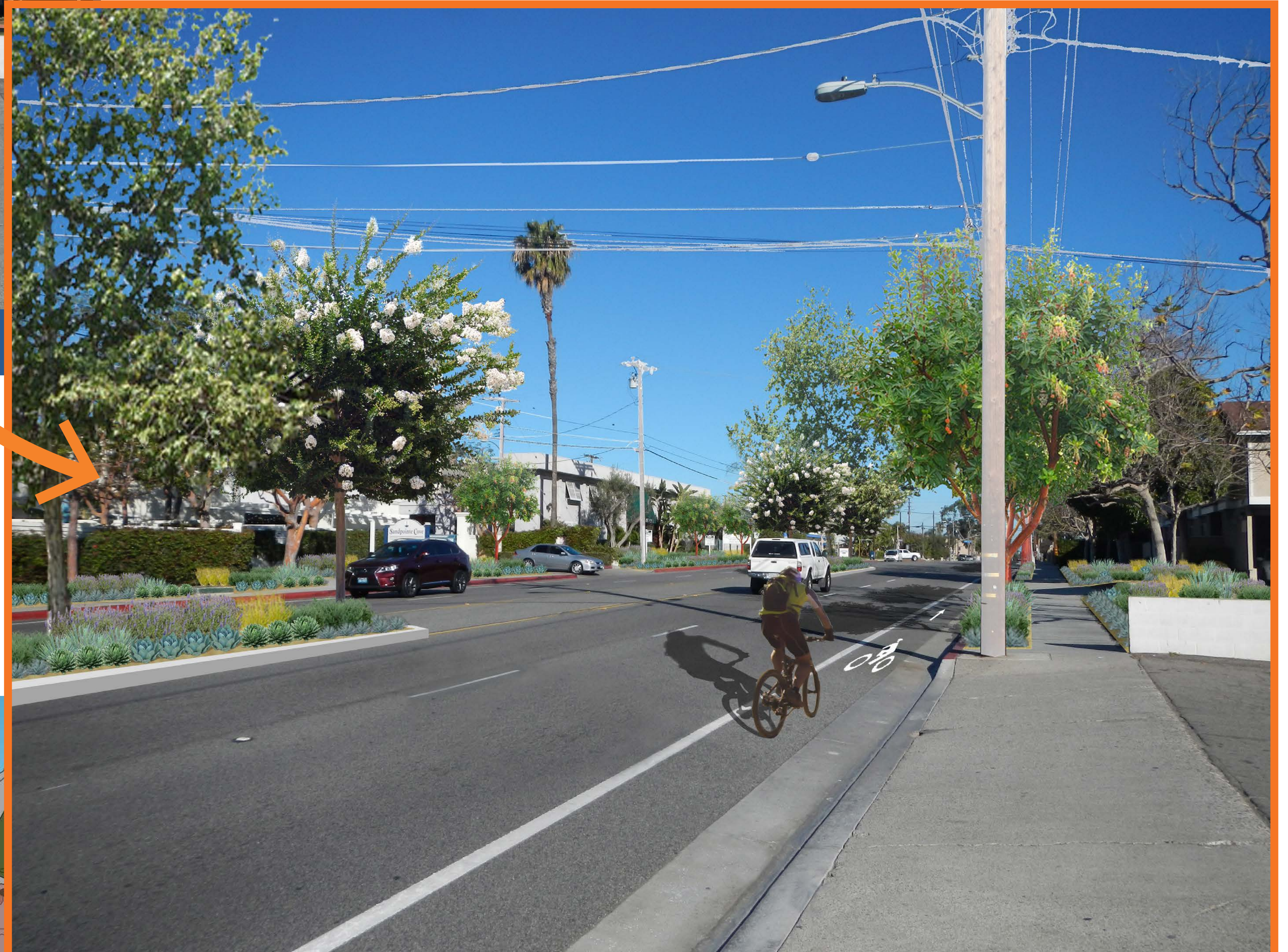
VISUAL SIMULATION LOOKING NORTH ON PLACENTIA, ADJACENT TO KING LIQUOR.