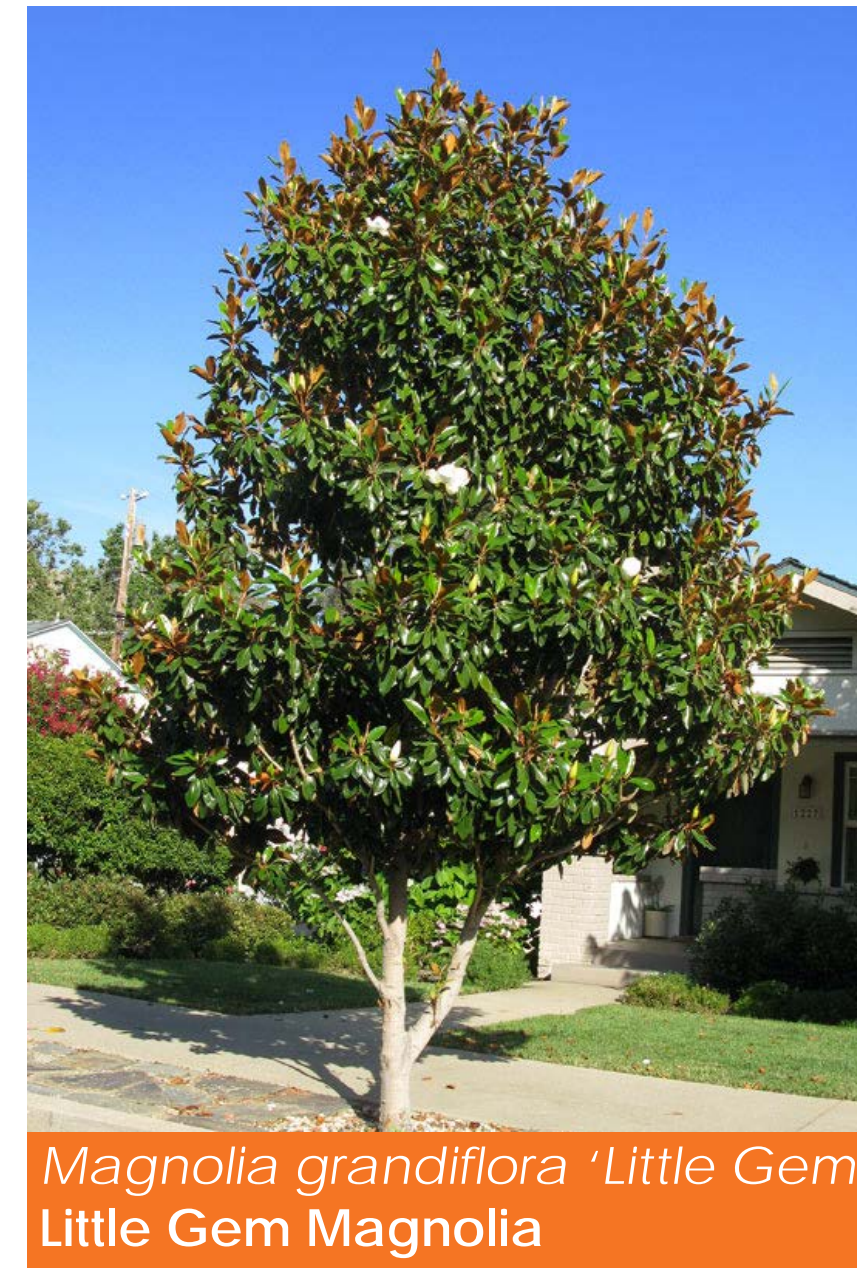
Magnolia grandiflora 'Little Gem' Little Gem Magnolia