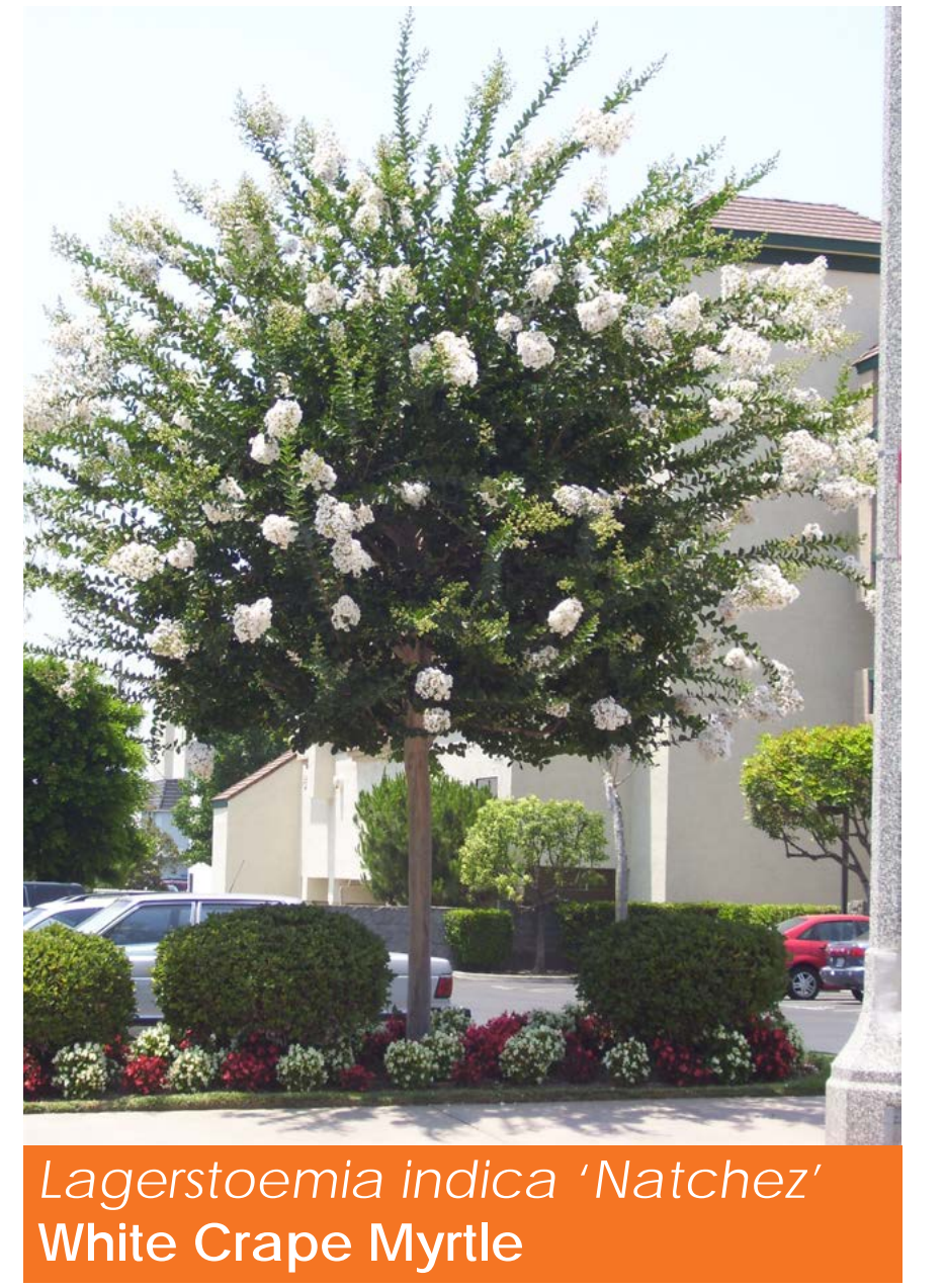
Lagerstoemia indica 'Natchez' White Crape Myrtle