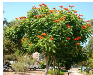
AFRICAN TULIP TREE