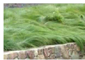
CALIFORNIA MEADOW GRASS