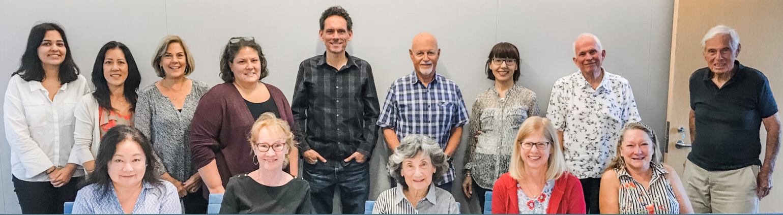
Pictured above: NMPL's most recent class of graduating tutors (See Page 2)