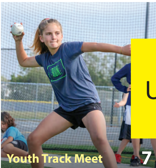
Youth Track Meet 7