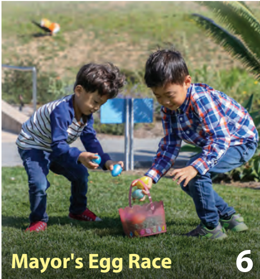
Mayor's Egg Race 6