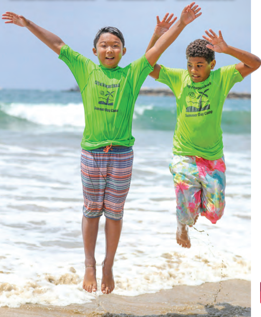
Table of Contents SUMMER CAMPS 2022

BE CREATIVE • BE ACTIVE BE ADVENTUROUS • BE MINDFUL • BE CURIOUS