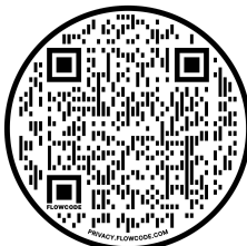
Schedule a Home Assessment

For more information, please scan the QR codes or call (949) 644-3106 to schedule a Wildfire Home Assessment.