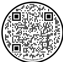
Schedule a Home Assessment