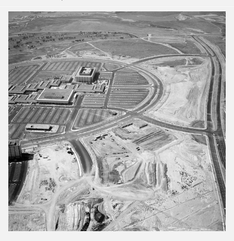
Exhibit 2. Construction of Fashion Island, 1967.