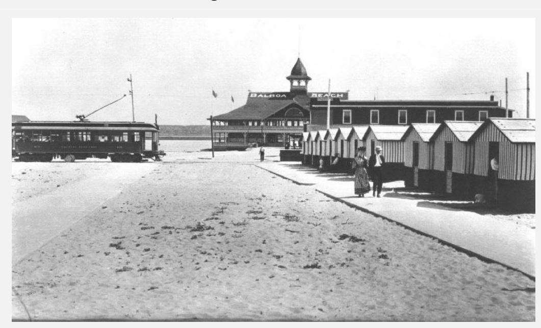
Exhibit 1. Pacific Electric's Red Car Line taking visitors to the Balboa Pavilion, 1910.

The early 1900s brought new subdivisions to Newport Beach, including Corona del Mar, East Newport, Balboa, and Balboa Island. This was after the establishment of the Pacific Electric's "surf line," which ran along the coastline from Long Beach (nicknamed the Red Cars). Local developers dredged the bay and created human-made islands to establish land adequate for new residential developments. With the increase in residences came civic improvements. In 1906, the City of Newport Beach was incorporated, claiming to have 700 residents, though the majority were only summertime residents. Development during this period included small hotels, beach cottages, and tourist attractions such as the Balboa Pavilion and the Balboa Pier (Exhibit 1). Improvements to the area continued, including jetty construction and further dredging of the harbor. Development was slowed by the start of World War I and an economic depression. 11