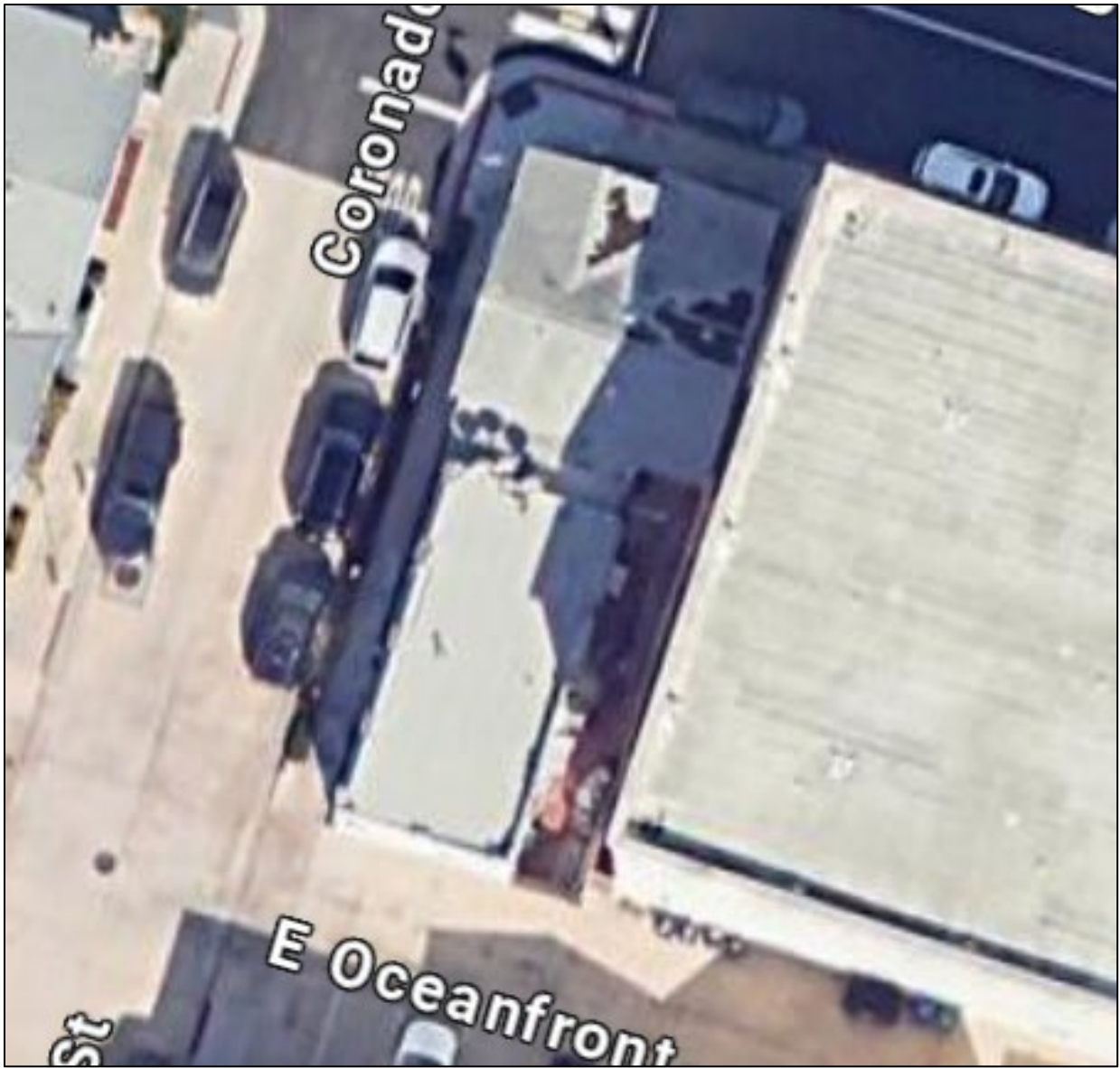
Figure 2: Project Site Location – 301 E. Balboa Boulevard