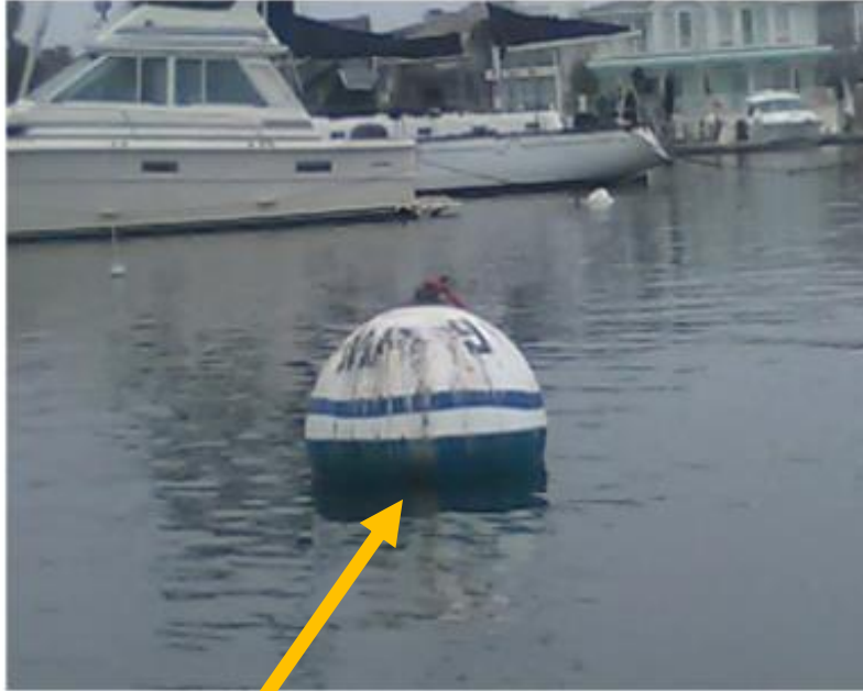
City Owned Marina Park Sand-line Buoy With bird excreta

Does the wording of this forbid the scrubbing and/or power-washing of docks/ mooring buoys/ boats/barges/etc?