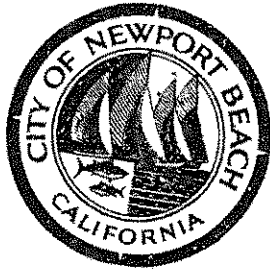
_____ City Clerk City of Newport Beach, California

IN WITNESS WHEREOF, I have hereunto subscribed my name and affixed the official seal of said City this 11 th day of September, 2013.