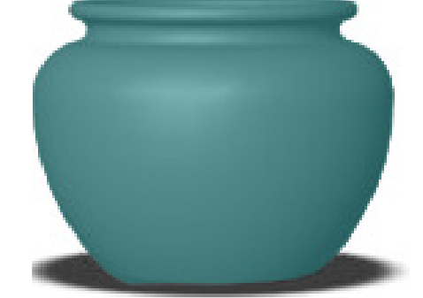
PURE MODERN - MODERN ROUND PLANTER POT