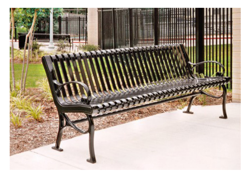
VICTOR STANLEY 4 FOOT CR-138 CLASSIC COLLECTION BENCH

*When the Quickcrete Kelp trash receptacle must be replaced, use the Victor Stanley trash receptacle shown.