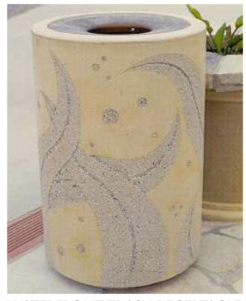
WATERFRONT TRASH RECEPTACLE VILLAGE TRASH RECEPTACLE - QUICKCRETE